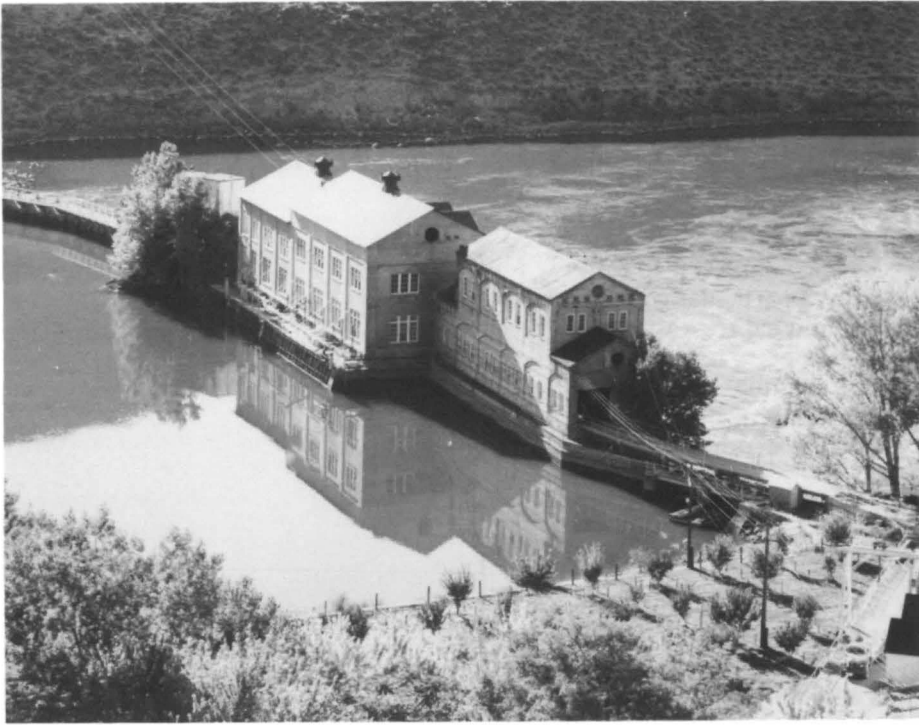
Swan Falls Dam and Power Plant, Murphy vicinity, Ada County, Idaho. Significant works of engineering can qualify under Criterion C. Built between 1900-1907 the Swan Falls Dam and Power Plant across the Snake River is one of the early hydroelectric plants in the State of Idaho.