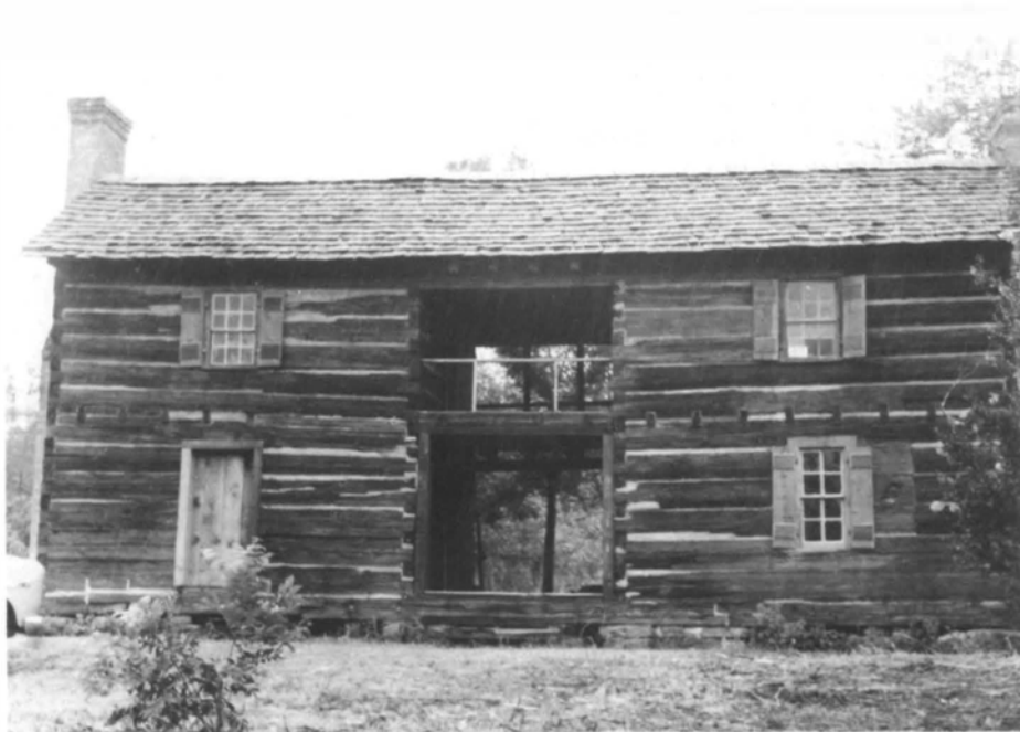
Looney House , Asheville vicinity, St. Clair County, Alabama. Examples of vernacular styles of architecture can qualify under Criterion C. Built ca. 1818, the Looney House is significant as possibly the State's oldest extant two-story dogtrot type of dwelling. The defining open center passage of the dogtrot was a regional building response to the southern climate.