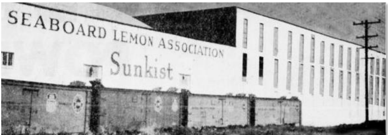
Figure 4 – Historical View of Property

The property could not be located in any previous historical survey at the time of this report. However, the Sunkist/Ventura Pacific Co. Facility is known to date at least until 1936, when it was operated by Seaboard Lemon Association. Refer to Figure 4 for a historical photo of the subject property.