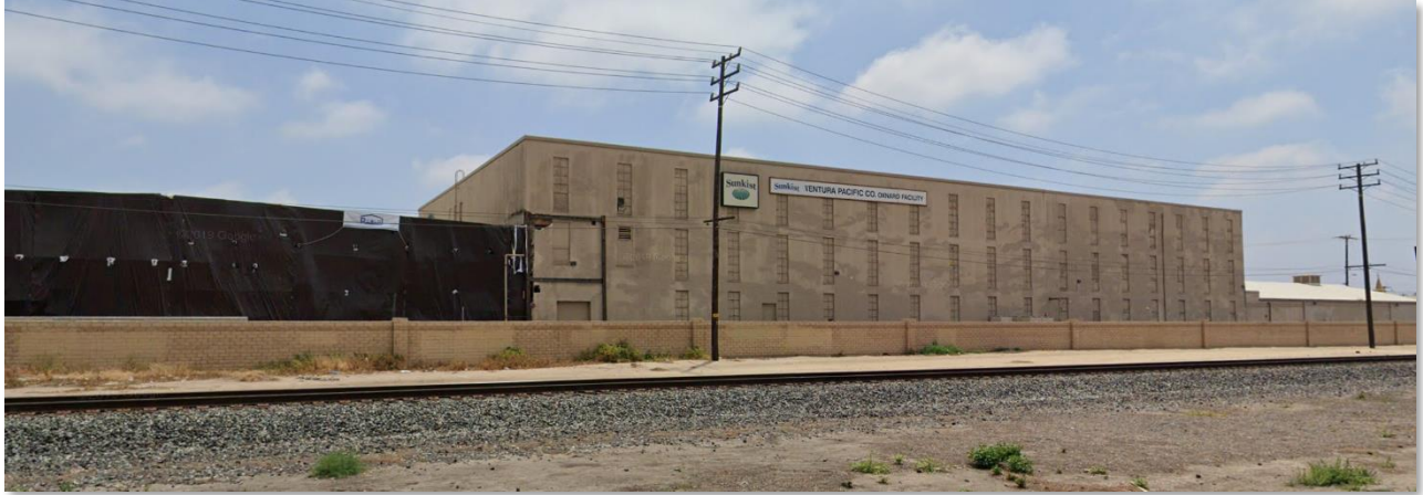
Figure 3 – View of Property from Oxnard Boulevard, looking Northeast