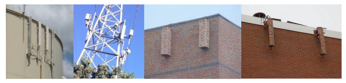
Examples of Flush Mounted Wireless Communication Facilities (ADD. ORD. 4470 - 3/24/15)

<u>Wireless Communication Facility</u>, <u>Flush-Mounted</u>: A <u>wireless communication facility</u> with an <u>antenna</u> attached directly to the exterior of a <u>structure</u> or <u>building</u> and that remains close and is generally parallel to the exterior surface of the <u>structure</u> or <u>building</u>. Associated equipment for the <u>antenna</u> is not flush-mounted and is located inside an existing <u>building</u>, on a rooftop, at the ground level, or underground. (See Section 8107-45.)